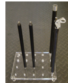
Mag roller holder