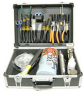
Complete Tool kit